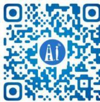
WeChat Official Account